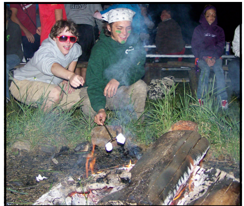
Roasting Marshmallows over the campfire at Camp Victory.

The camp is staffed by mature adults and experienced professionals, including a Camp Director, a physician Medical Director, and experienced Counselors. All staff (many have diabetes themselves) are trained in child development psychology, working with children and diabetes health issues.